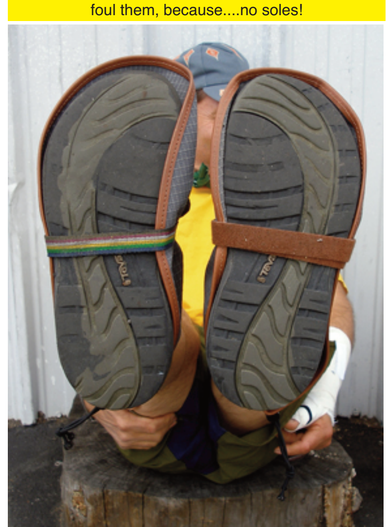
....cling them around the instep. We'll have this all worked out by next Fall