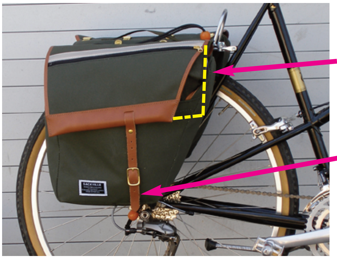
reshape this for better coverage, and it's OK to lose the countour with the front edge.

lengthen strap 2-inches so it'll reach with a too-big load, still.