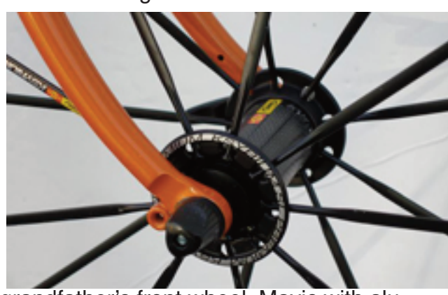
not your grandfather's front wheel. Mavic with aluminum bladed spokes.

steel steerer lets you raise the bar much higher than a carbon steerer does. Still, not your grandad's bar-stem rig.